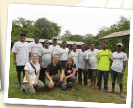
What goes around comes around.