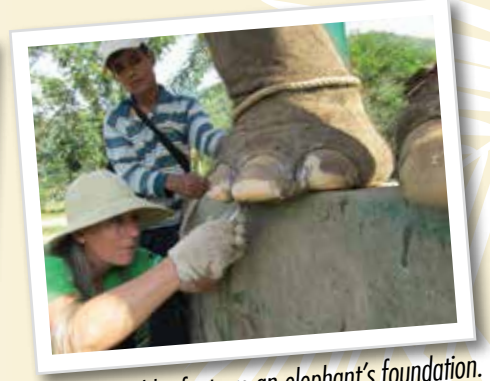
Healthy feet are an elephant's foundation.